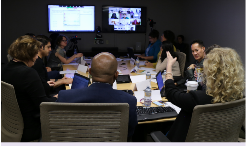
Using videoconferencing, an ECHO team at CAMH provides virtual training and capacity building to support health care providers to deliver care in local communities.

Our educational programs reached caregivers across Ontario through the CAMH/UofT ECHO program, which rapidly activated offerings during the early days of COVID-19.